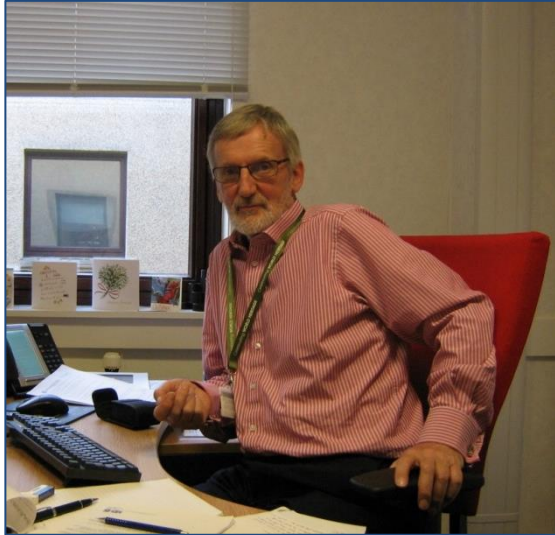
Angus Carmichael Scottish Road Works Commissioner

In August 2015 the Scottish Ministers announced that the Office and Functions of the Scottish road Works Commissioner were to be reviewed. I was subsequently appointed as Commissioner for a period of two years to guide the office through the review period.