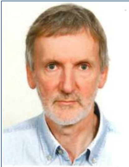
Angus Carmichael Scottish Road Works Commissioner

As I approach the end of my 5 year tenure as Scottish Road Works Commissioner, I am delighted to present the new Corporate Plan for the office of the Scottish Road Works Commissioner, covering the next 3 years.